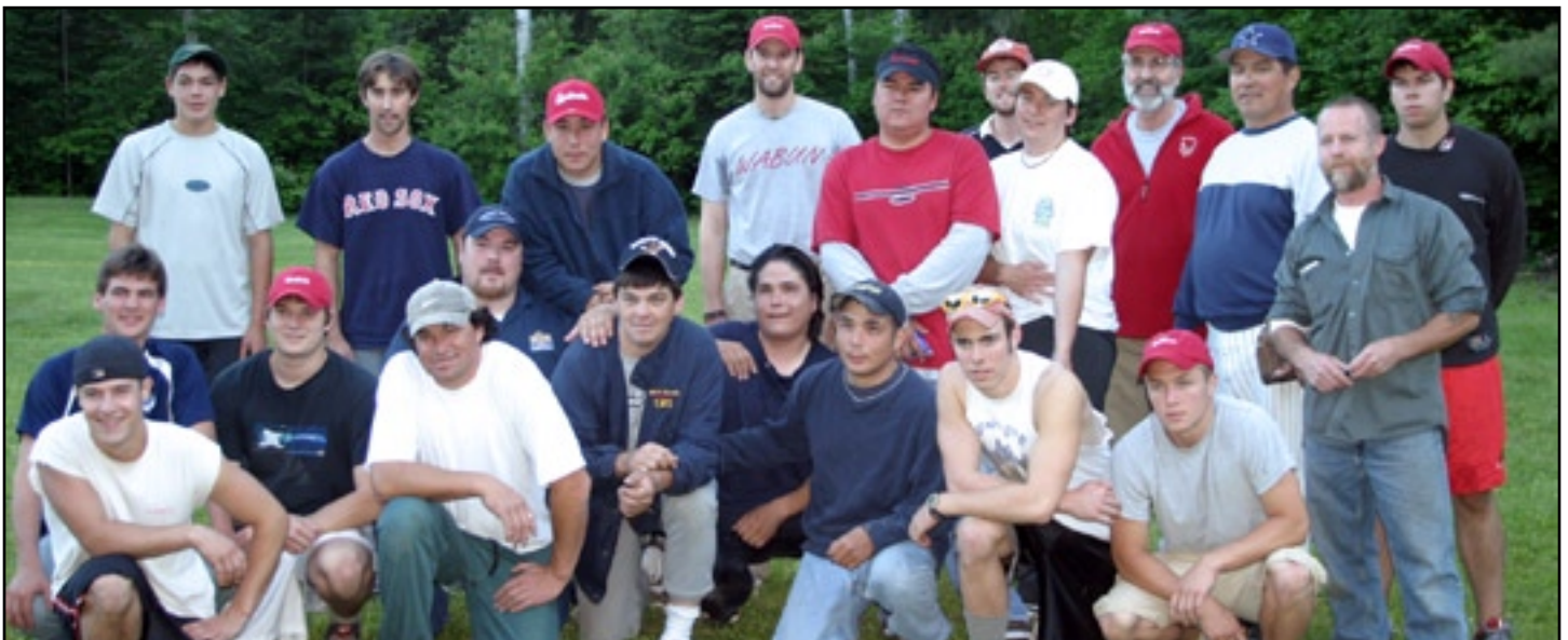
Players in the annual Bear Island - Wabun staff softball Game