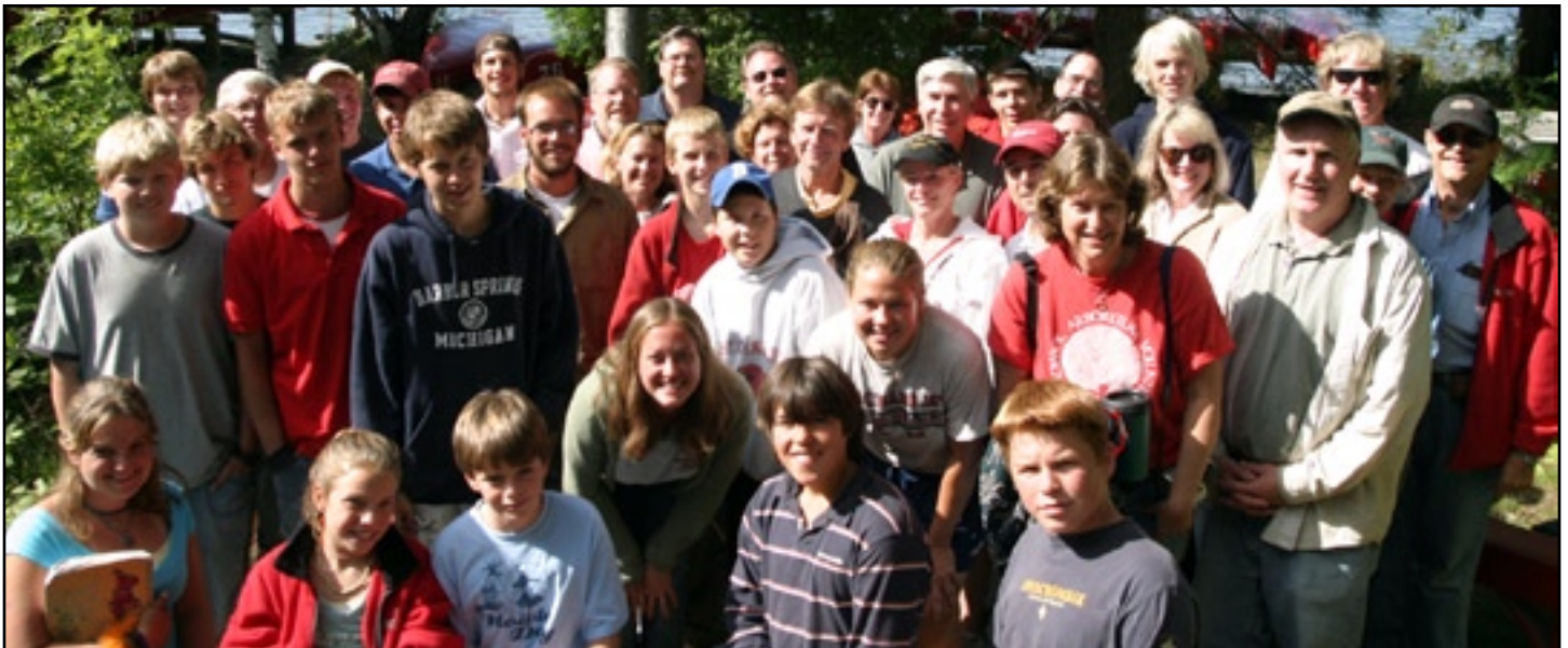
A very impressive gathering of campers, staff, parents, and visiting alumni/ae from Ohio