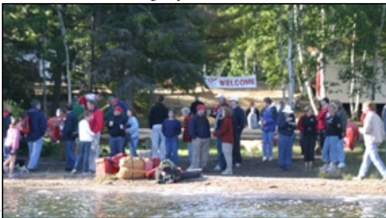
Parents awaiting the campers return to camp on August 7th.