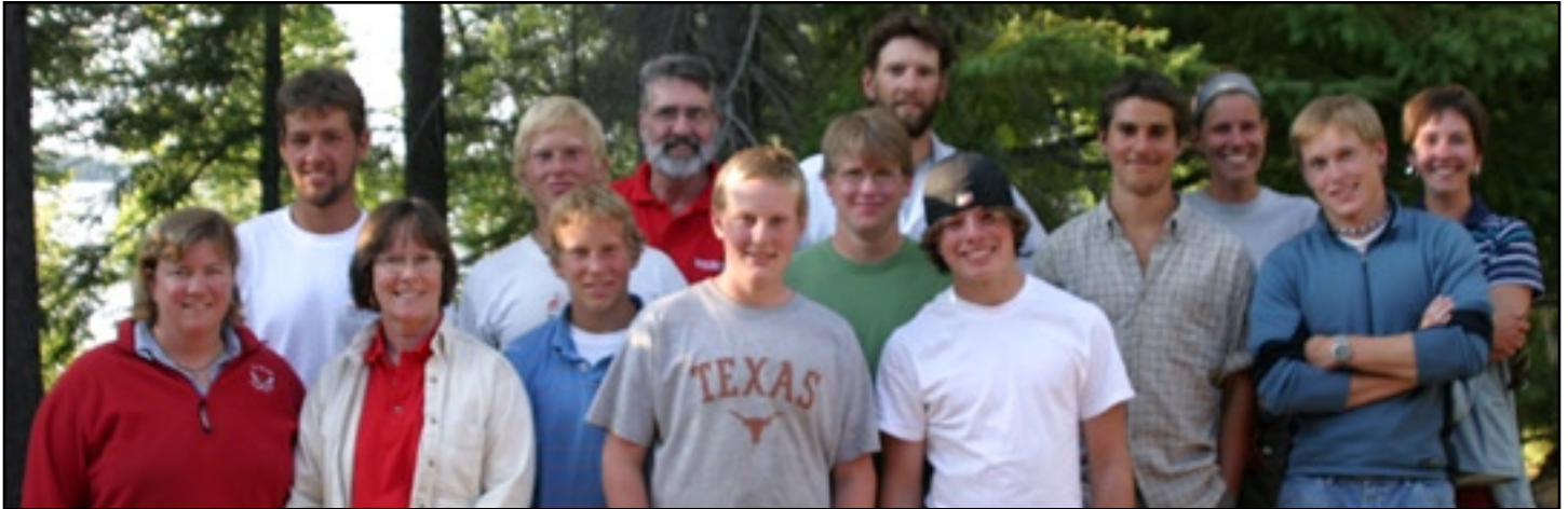
Minnesota campers, staff, and visiting alumni/ae