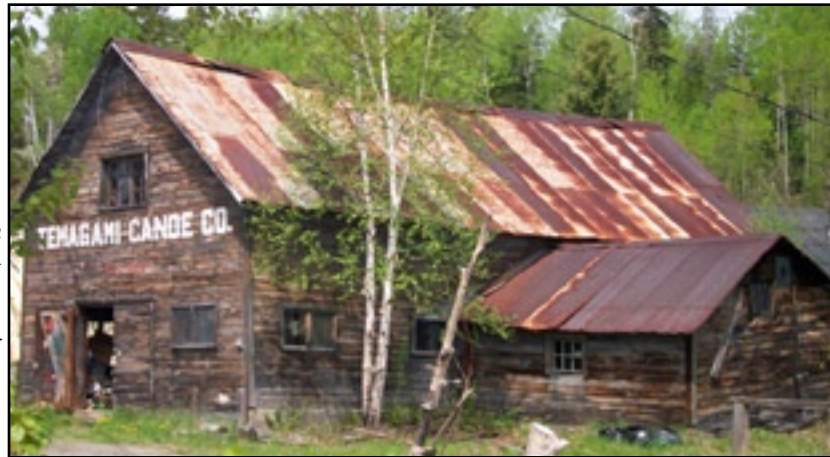
The Temagami Canoe Company in Temagami

When I was a camper at Wabun, it was during the era of wood, canvas and leather. Everything we used from the tents,