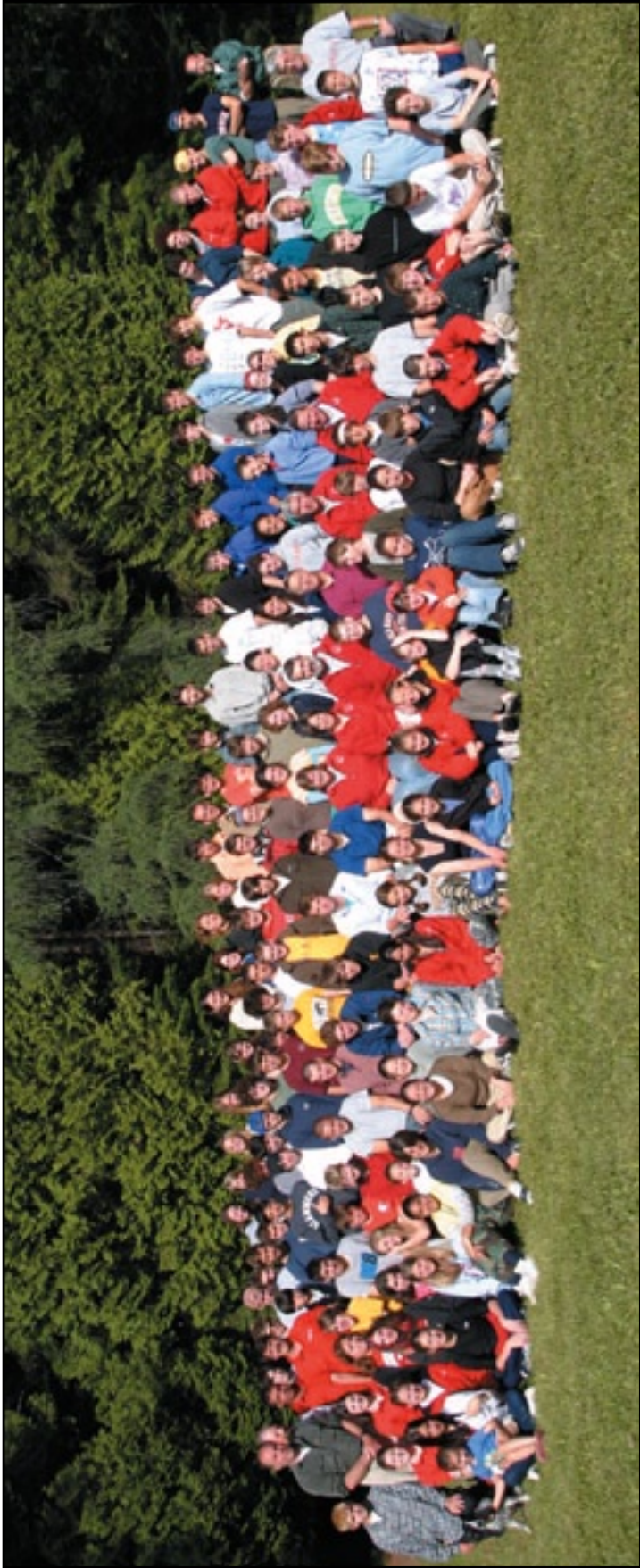
First and Full Sessions