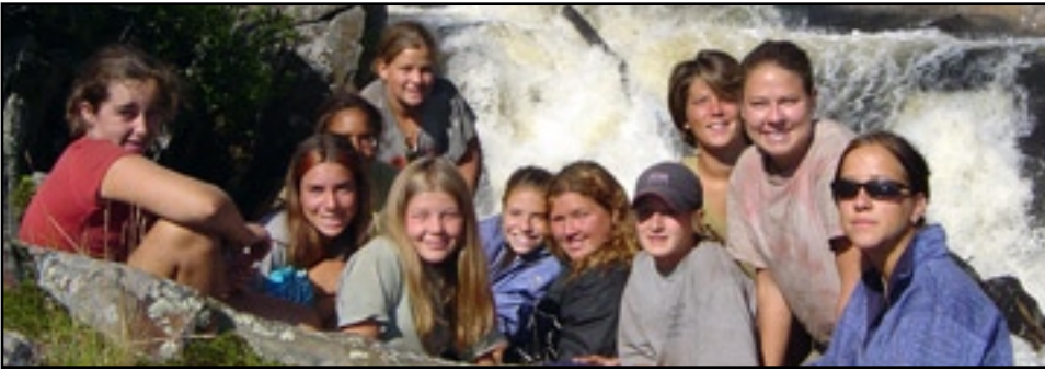
A highlight from the Cree T Log

It all started one crisp summer evening. Her name was Danielle. She had soft...whoops wrong story!