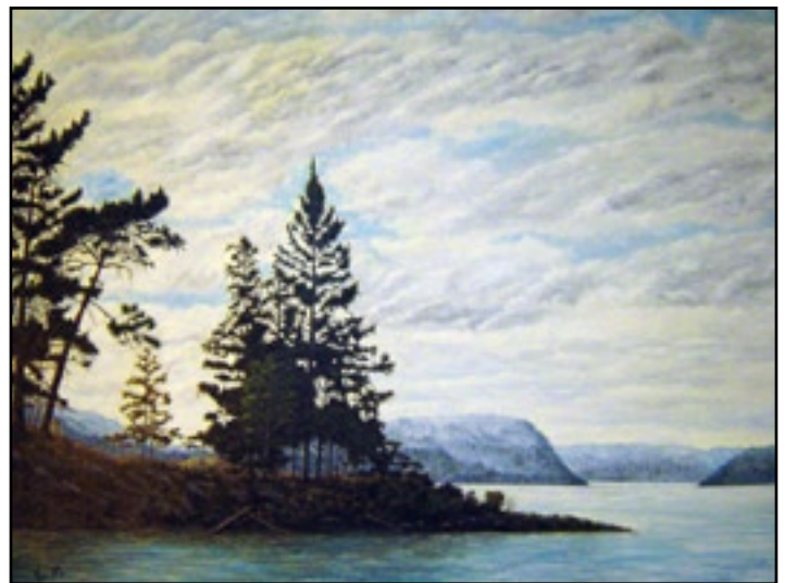
Ferguson Bay, Lake Temagami - Painting by Vagn Petersen 1979